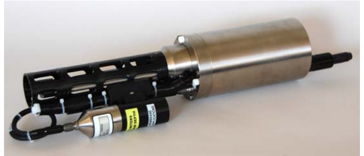
Shown with optional SBE 43F Dissolved Oxygen Sensor

The SBE 52-MP is a conductivity, temperature, depth (pressure) sensor (CTD), designed for moored profiling applications in which the instrument makes vertical profile measurements from a device that travels vertically beneath a buoy, or from a buoyant sub-surface sensor package that is winched up and down from a bottom-mounted platform. The 52-MP incorporates pump-controlled, TC-ducted flow to minimize salinity spiking. On typically slow-moving packages (e.g., 20 - 50 cm/sec), its sampling rate of once per second provides good spatial resolution of oceanographic structures and gradients. The 52-MP can optionally be configured with a Dissolved Oxygen sensor module (SBE 43F), as shown in the photo. The SBE 43F is a frequency-output version of our SBE 43 Dissolved Oxygen Sensor, and carries the same performance specifications.