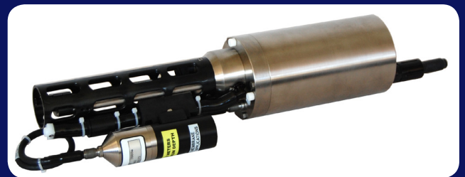
Shown with optional SBE 43F Dissolved Oxygen Sensor

The SBE 52-MP's pump-controlled, TC-ducted flow minimizes salinity spiking, and its 1 Hz sampling provides good resolution of oceanographic structures and gradients on typical slow-moving packages (20-50 cm/sec). Data are output in real-time in engineering units (mmho/cm, °C, decibars, ml/l) or raw hex or binary.