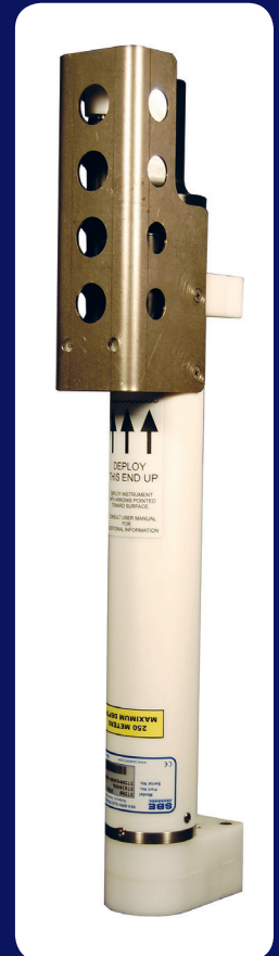
Deploy in orientation shown (sensors at top) for proper operation