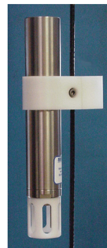
With optional clamp.